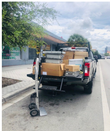
Shipping supplies from Miami