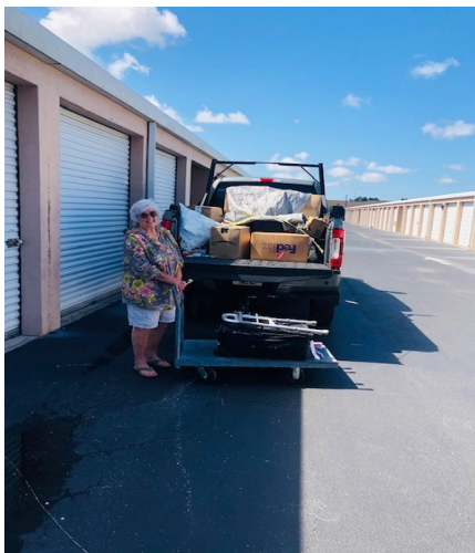
Collecting Medical Supplies In Sarasota