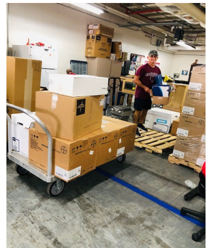
Collecting medical supplies at Lakeland Regional