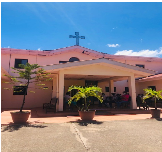
Main entrance to San Benito Jose Hospital.