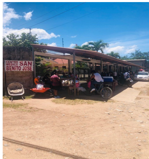
Sunday prior. Patients are coming for assessment with our Surgeon. Patients are already screened by the local Doctors.