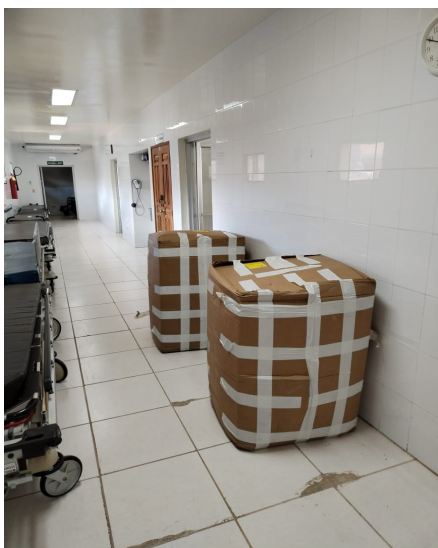
These two boxes are the shipment sent this December. Each box weighs over 200lbs.