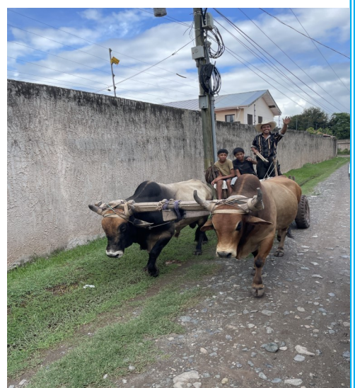
"Traffic jam" in Comayagua.