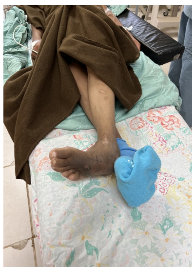
Like I said, life changing surgery.