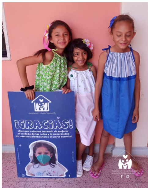
Dresses donated to the girls of Hogar Nazareno.