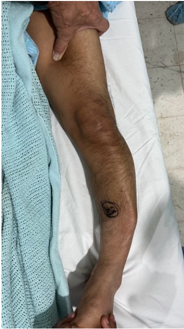
Guatemala: this guy broke his leg during the pandemic. Went untreated and healed out of alignment.