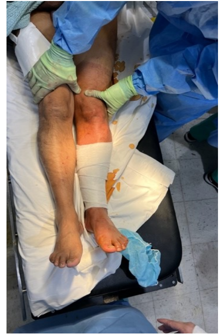
Our surgeries are in almost field conditions, but deliver good results.