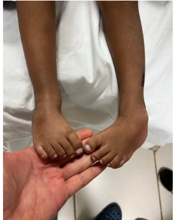
We only give what God has given us. We must use our vocations to help each other.