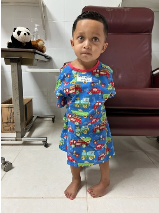
This is life changing. Giving this little boy a better chance in life.