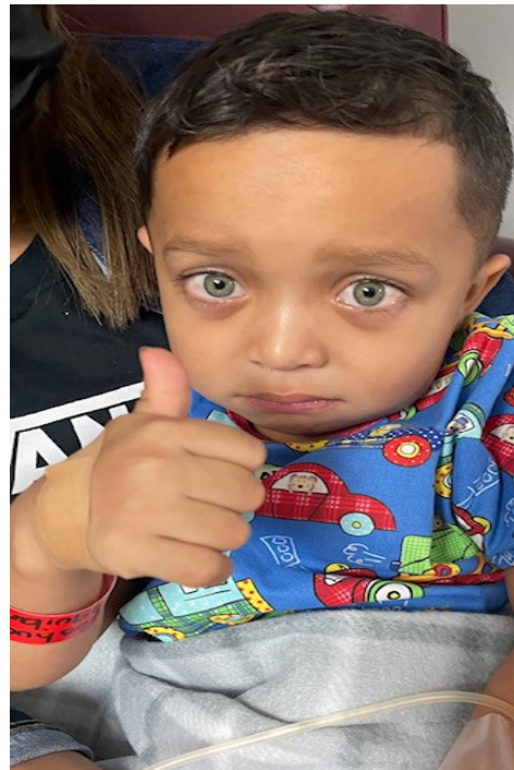
I wonder what was going through his mind. Probably scared, but hopeful.