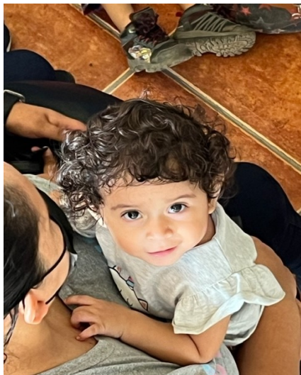
Helping these beautiful kids keeps us coming back