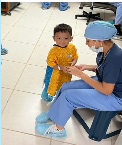
A little patient with a local volunteer who helped us translate. We get some kids to volunteer as translators from the local bilingual schools.