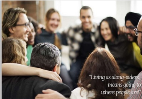
"Living as along-siders, means going to where people are!"

"New starts reach more new people for Christ."