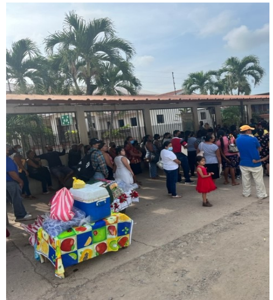
Main entrance at San Benito Jose