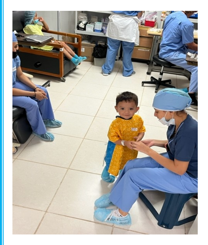
We also get local volunteers.