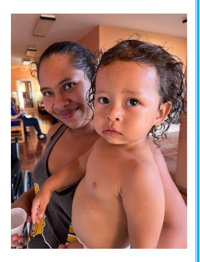
A baby waiting for consultation with the surgeon.