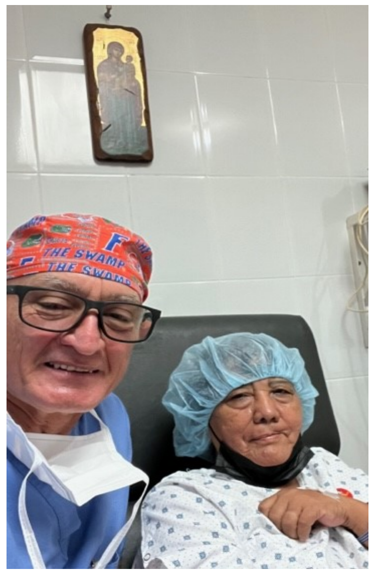
You never know. This lady could be my relative. The same last name, recognized names of our old relatives.