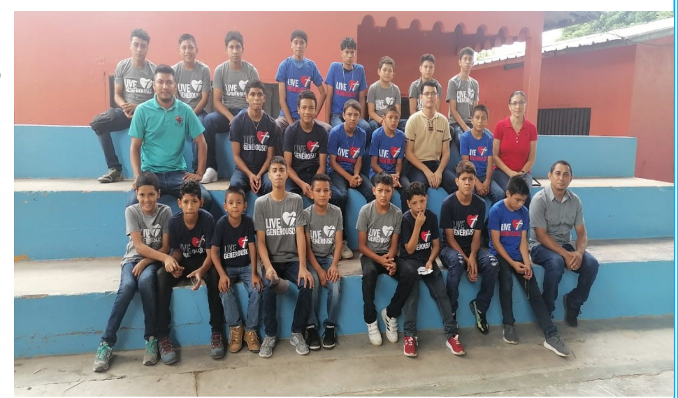
The boys orphanage - the t-shirts look familiar

One of the orphanages we help sent a thank you note along with a couple of pictures through WhatsApp. They are very grateful for the donations that Christ Lutheran Church collects in the Honduras box in the narthex or through collections at the Dream Center. You may recognize the t-shirts in the pictures.