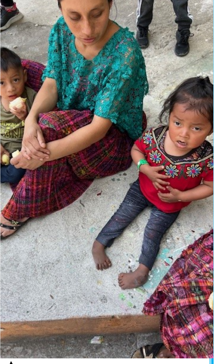
One of our young patients for our week of surgeries. The younger the patients; the more specialized care they require.

One of our patients. He lost his hand to amniotic bands; now we will be working on his right foot. Last year we worked on his left foot.