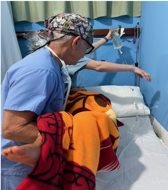
Carrying a child after surgery.