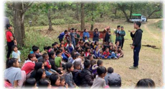
Ministry to Displaced Children