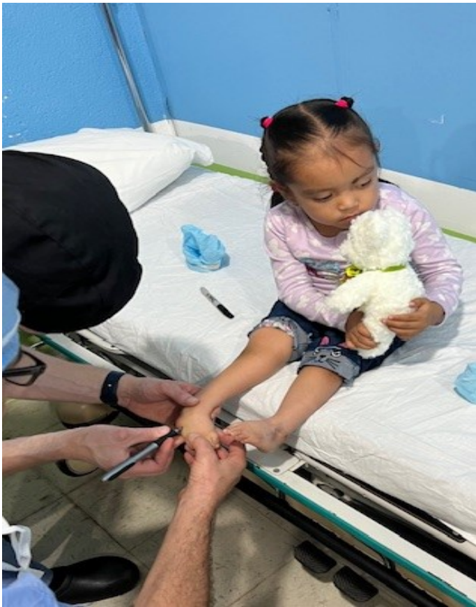
The assessment and planning of surgery.