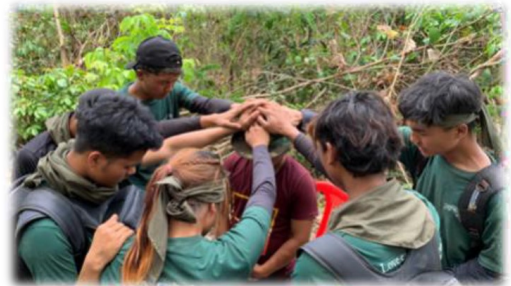
Training spiritual leaders