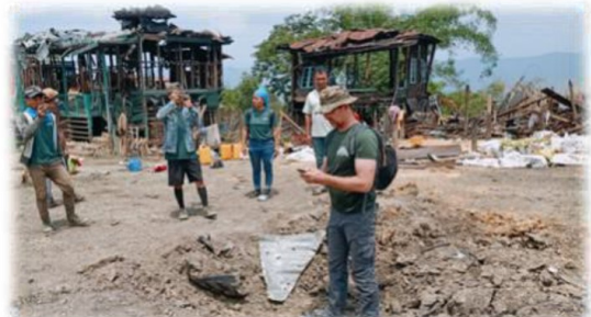
Documenting war crimes and human rights violations