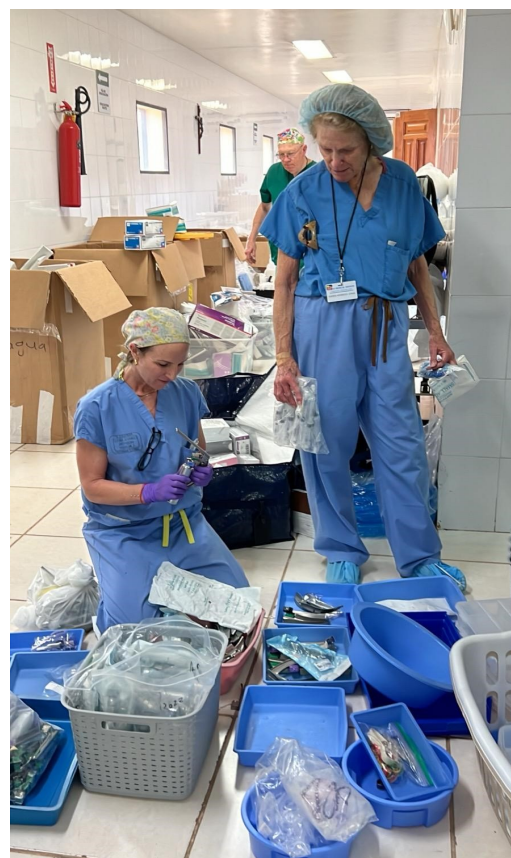
Donated medical supplies for Hospital San Benito Jose shipped by Christ Lutheran Church.