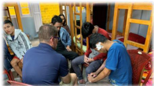
Ministering to victims seriously injured in conflict zones