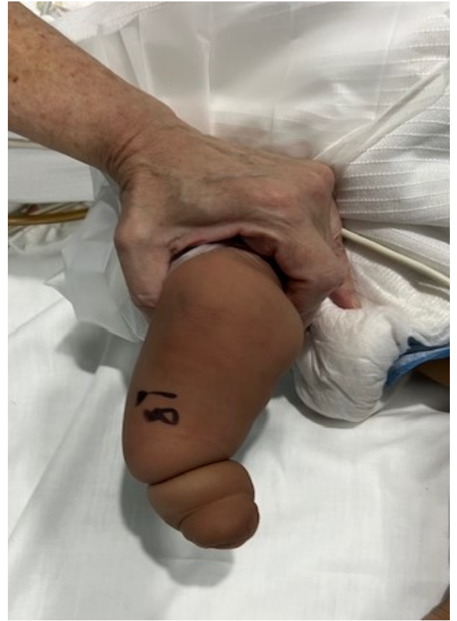
Children born with omniotics bands if untreated; results in painful amputations