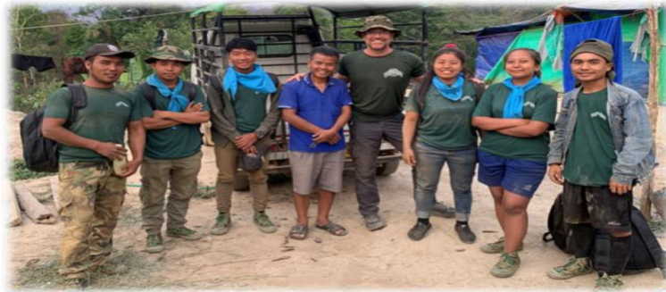
Training Indigenous Teams