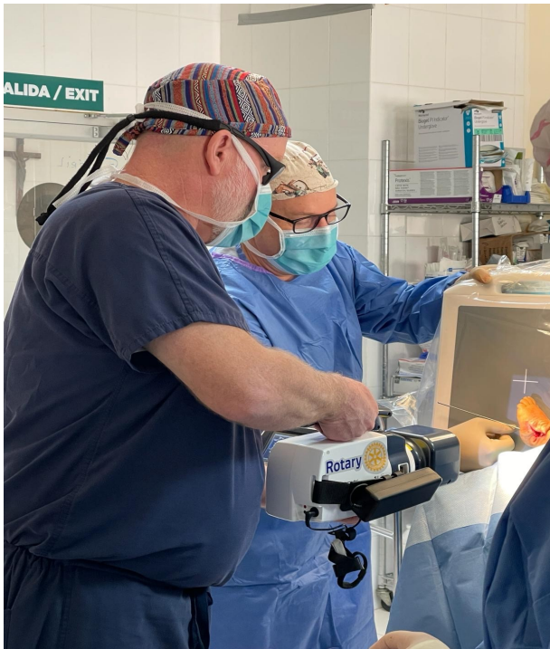
Thirty thousand dollar portable X-ray machine. Donated by Findalgo Rotary Club from Washington state.