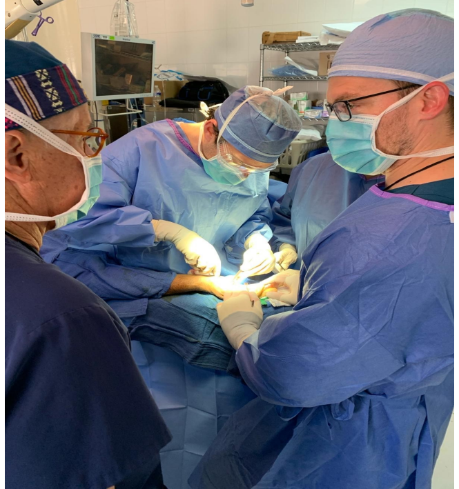
Inspiring to see young surgeons volunteering