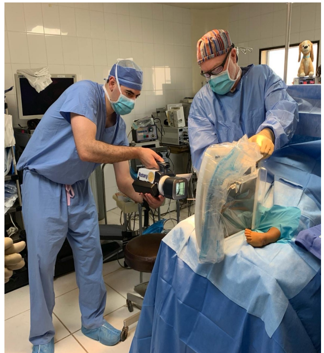
Portable X-ray machine. We have one in Honduras and another in Guatemala.