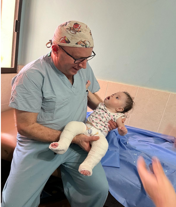
Our Canadian Podiatrist.