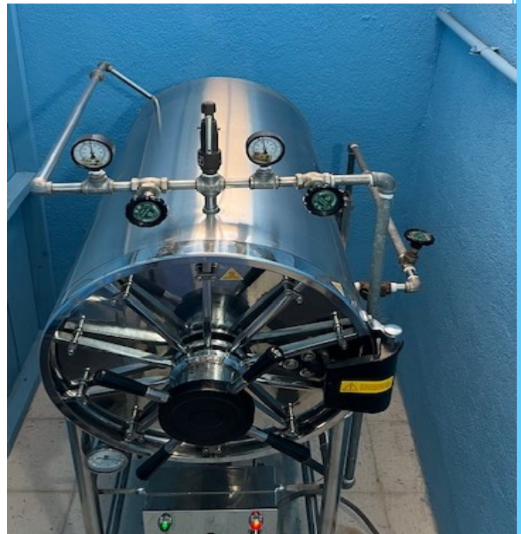
It looks difficult but with the help of God we will do our best.