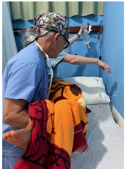
Some of our patients in Guatemala