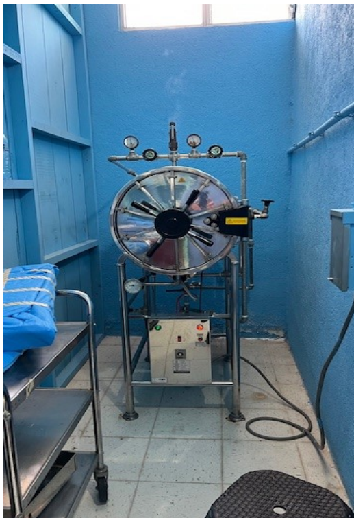
This is my target for the sterilizer. There price range is from 7 to 8K.

My next step is to do good research in purchasing the two sterilizers one for Guatemala and another for Honduras. I need to get the most for our dollars. I hope to have this purchase completed by December this year.