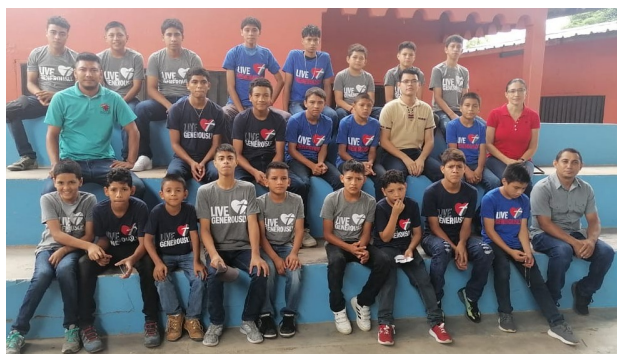
Boys from New Horizons showing their t-shirts.