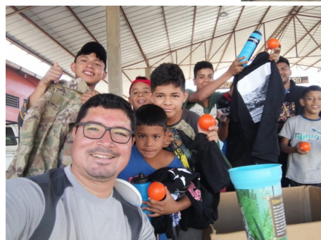
New Horizons Orphanage only for boys with one of their Teachers.