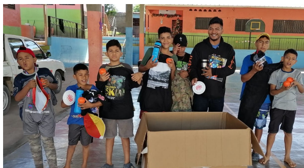
Our donations also contains toys for the kids