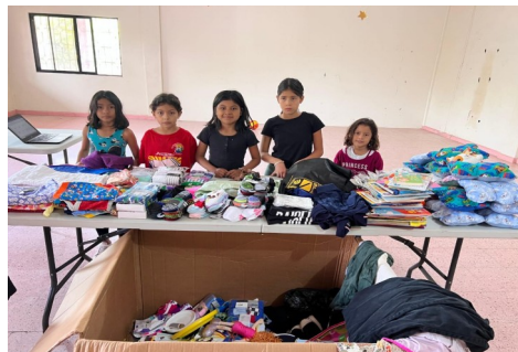
Hogar Nazareno Orphanage for girls and boys.