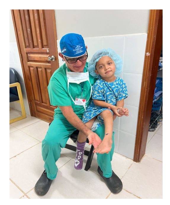
Holding one of our patients