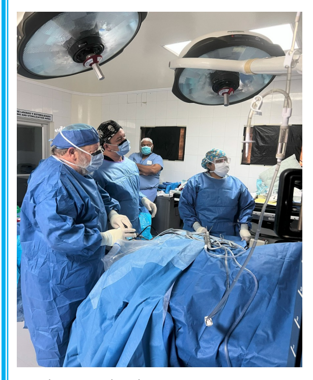
We also invite local practitioners to work with us.