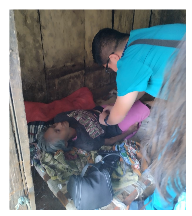
An elderly woman being assessed by a local resident. The Friars also have a resident program from the Medical School. They also joined our group.