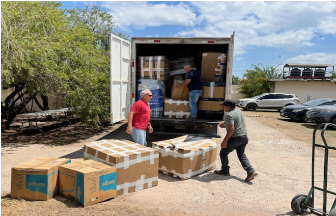
The hand of God! Our last shipment got there the day we needed it .