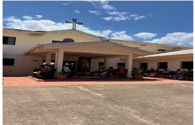
The lucky ones that will be evaluated by our surgeons.