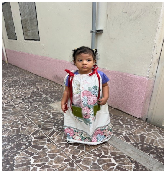
Little girl waiting to be sponsored at the Children's Home.