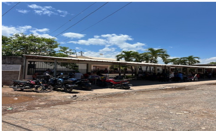
These people have been screened for social and health issues, but haven't been called yet.