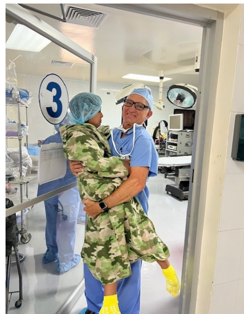
Sometimes, our little patients need some encouragement.