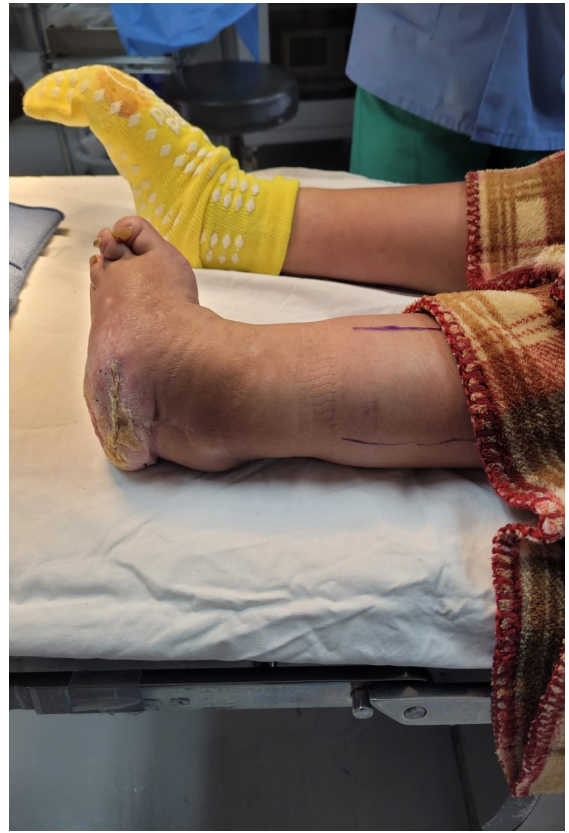
Both feet were like the left one. The right one was treated last year.