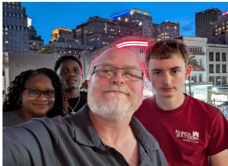
A view from the balcony of our hotel at the corner of Bourbon and Canal Streets.