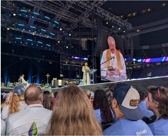
We were seated close to the action for Wednesday's concluding Divine Service.