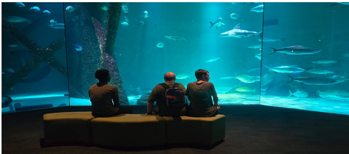
After the gathering, we took some time to decompress at the aquarium.